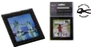
GLASS COASTER* Order code: ACG02 Works from 6x4" photo