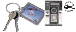
PHOTO METAL KEYFOB* Order code: AIMP08 Insert size: 1¾ x 1⅝ (35 x 45mm)