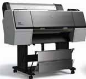
Stylus Pro 7890 - 24 inch