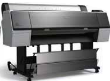
Stylus Pro 9890 - 44 inch

For a complete print - finishing - framing solution, look no further than the new DPS Printbox bundles. A great way to kick start your business.