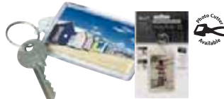
XTRA KEYFOB Order code: AIX02 Works from 2x3" photo