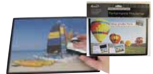
PERFORMANCE MOUSEMAT* Order code: AQM81 Insert size: 10x8"