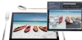
GLASS PLACEMAT* Order code: ACG81 Insert size: 10x8"